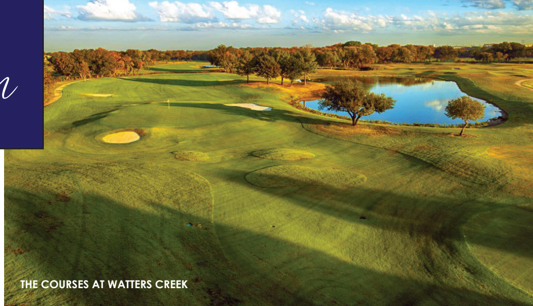
THE COURSES AT WATTERS CREEK

Allen High School Anderson Elementary Bolin Elementary Boon Elementary Boyd Elementary Chandler Elementary Cheatham Elementary Curtis Middle School Dillard Special Achievement Center Ereckson Middle School Evans Elementary Ford Middle School Foundation for Allen Schools Green Elementary Kerr Elementary Lindsey Elementary Lowery Freshman Center Marion Elementary Norton Elementary Olson Elementary Preston Elementary Reed Elementary Rountree Elementary STEAM Center Story Elementary Vaughan Elementary