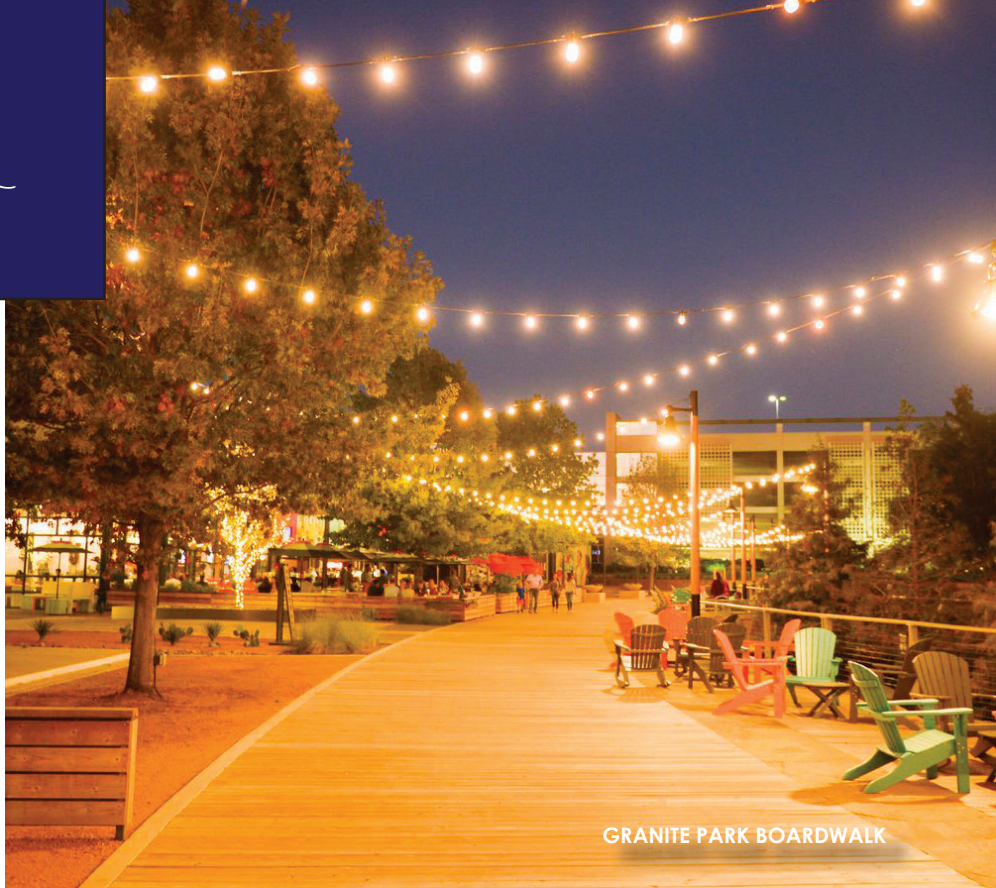
GRANITE PARK BOARDWALK

At Granite Park, it all comes together at the Boardwalk. The Boardwalk connects the office buildings at Granite Park with retail, hotel and dining options—all conveniently located with an unmatched waterfront view. Developed with community and sustainability at the core, the Boardwalk and outdoor gathering places support healthy choices and active, social living year-round. Explore the Boardwalk and discover the value of an office park centered on inspiring the community to connect.