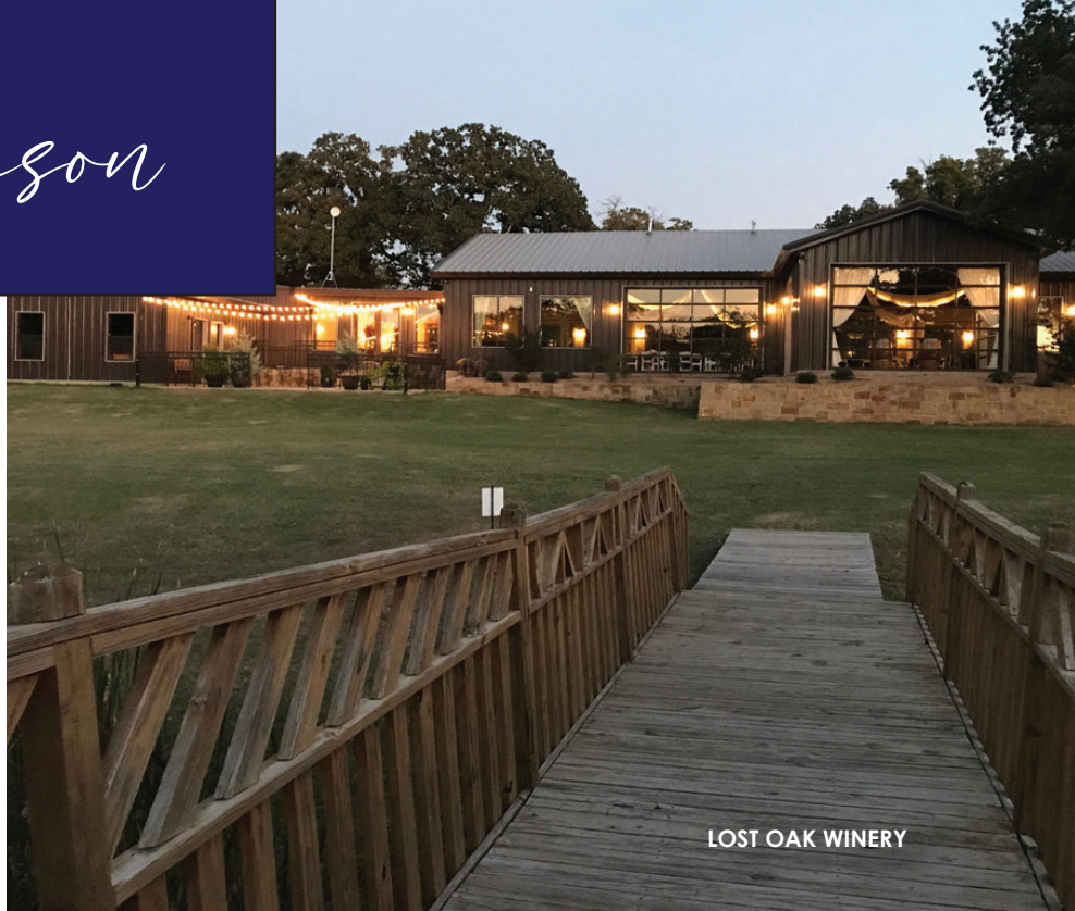
LOST OAK WINERY

Brock Elementary Clinkscale Elementary Frazier Elementary Hajek Elementary Taylor Elementary Hughes Elementary Kerr Middle School Burleson High School Centennial High School Crossroads High School Burleson Collegiate High School REALM Secondary School STEAM Middle School STEAM Academy at Stribling Norwood Environmental Science Academy Academy of the Arts at Bransom Academy of Leadership & Technology at Mound Academy at Nola Dunn