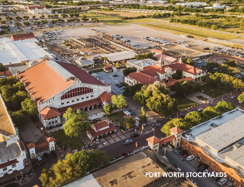
FORT WORTH STOCKYARDS