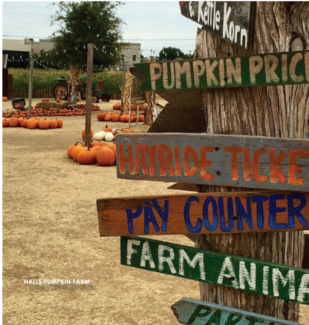
HALLS PUMPKIN FARM

Pic-OLOgy is an interactive art exhibit that features a variety of unique, creative art displays in ten different rooms. These displays combine the technology of today with traditional art forms to produce a multi-sensory experience that visitors can share through social media or through IRL interactions.