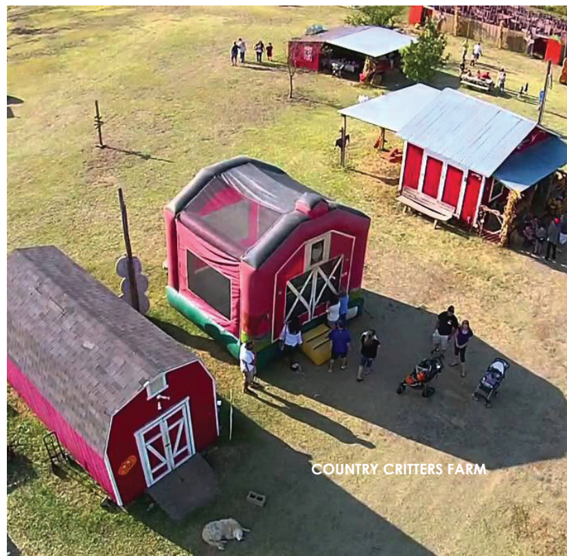
COUNTRY CRITTERS FARM

Venus Primary School Venus Elementary School Venus Middle School Venus High School