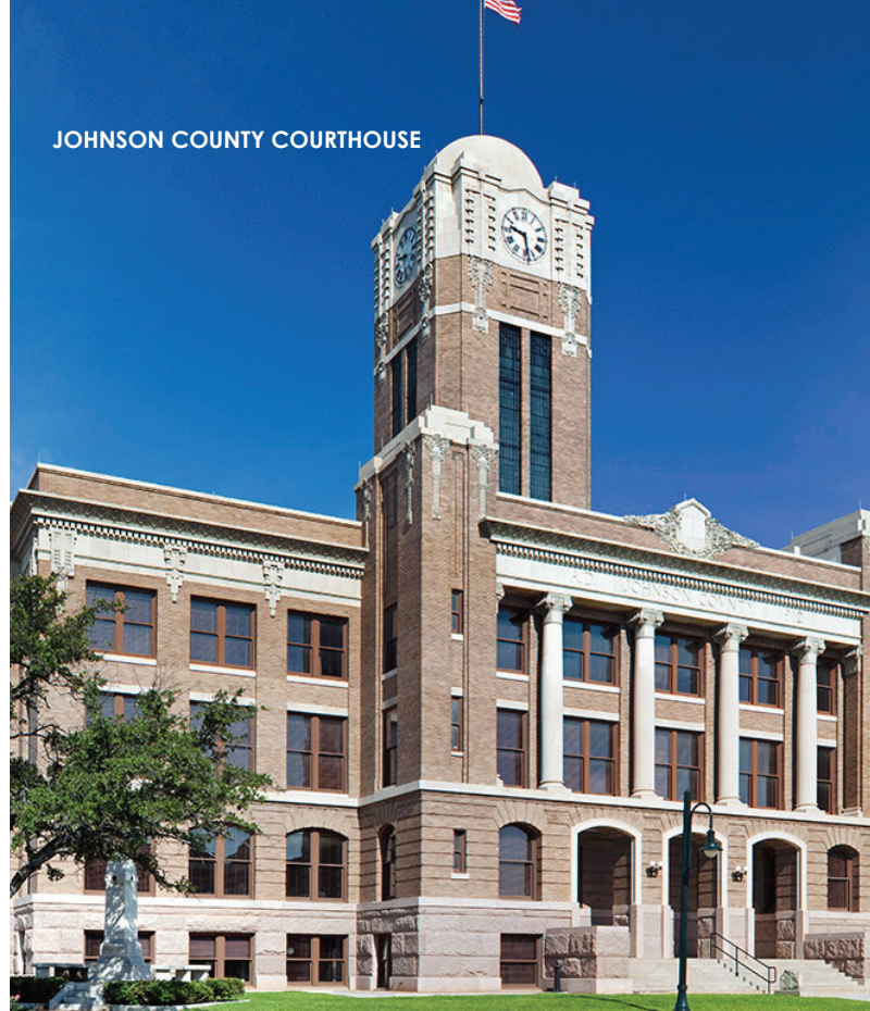
JOHNSON COUNTY COURTHOUSE