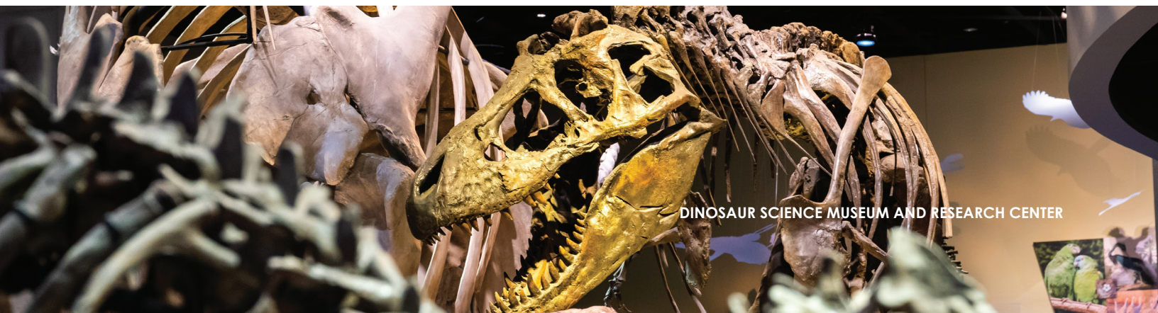
DINOSAUR SCIENCE MUSEUM AND RESEARCH CENTER

113 West Magnolia Street Southwestern Adventist University's Dinosaur Science Museum is a free, interactive, working research center, where you can watch bones go from dirt to display. Boasting the world's best fossil database and the largest collection of Lance Formation fossils, this unassuming museum takes taphonomic science to a new level.