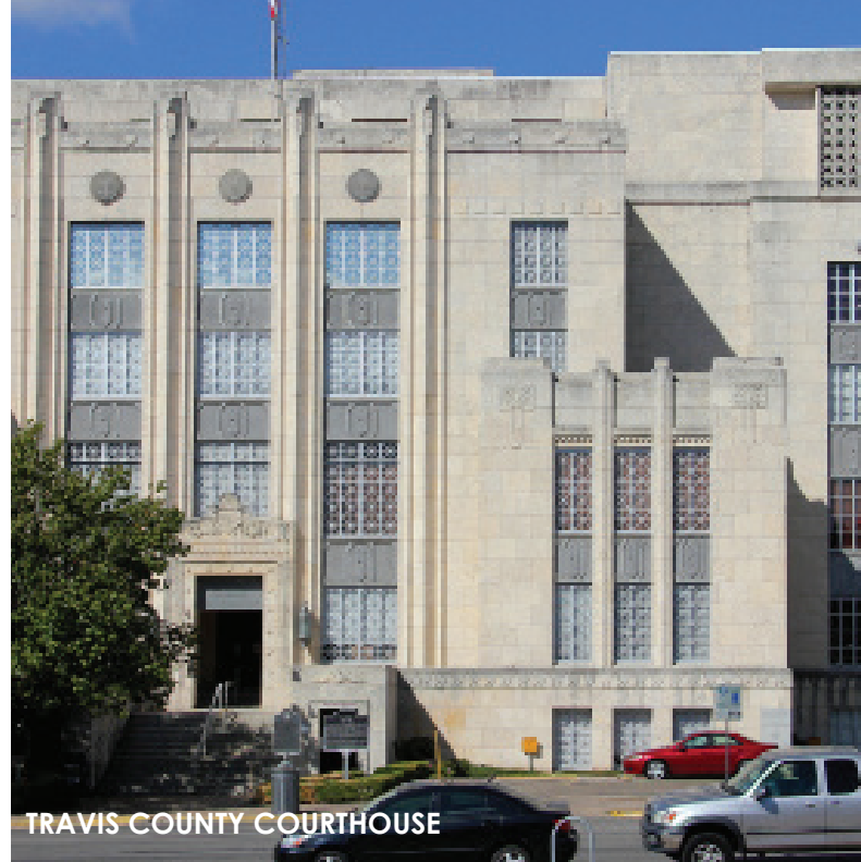
TRAVIS COUNTY COURTHOUSE