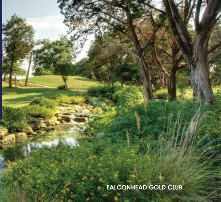
FALCONHEAD GOLD CLUB